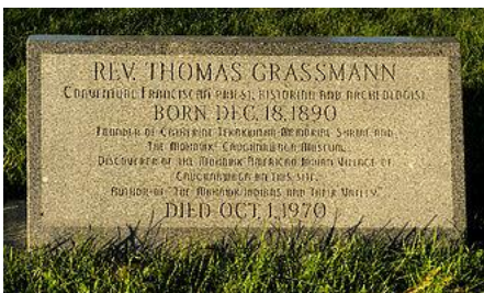
Grassmann's grave marker on the Caughnawaga site.