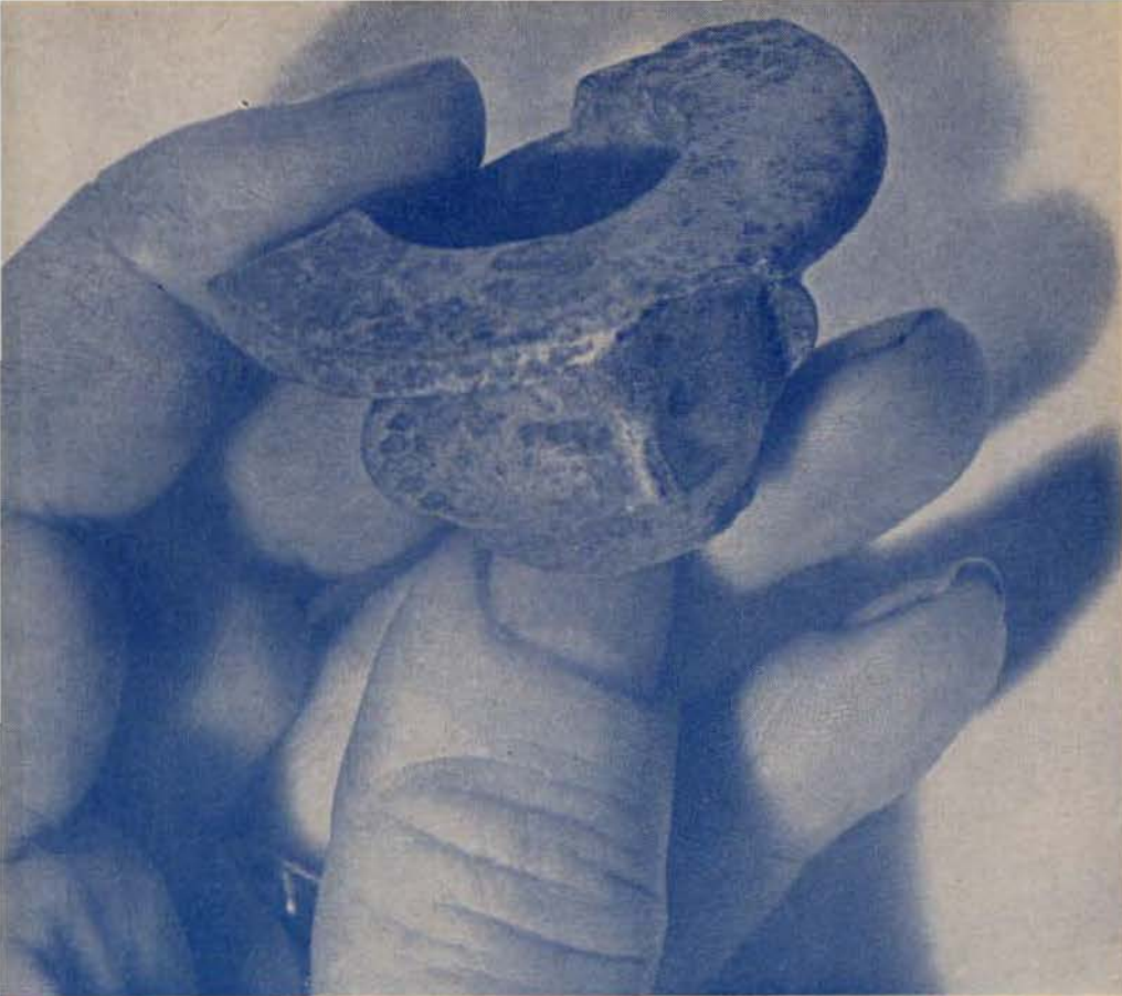
Indian pipe bowl reminiscent of a Jesuit's shovel bat