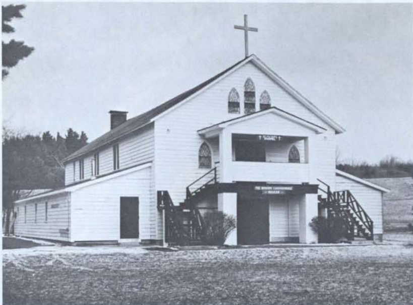
The Tekakwitha Memorial Shrine