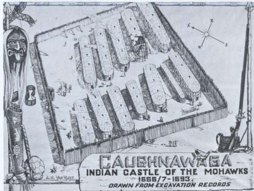
Here Kateri was baptized on April 18, 1676, by Father Jacques de Lamberville, S.J.