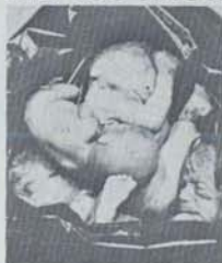
Babies Murdered Before Their Birth

Did you know that Quebec Social Affairs minister, Dr. Denis Lazure had announced that he intended to have 10 abortion clinics in operation in the Province by the end of last March? All pro-life organizations in the Province are protesting against his nefarious activity. To my knowledge, there is already an abortion clinic in Laval, and another one at Rosemont, Que. You can help by writing to Dr. Lazure, René Lévesque, and your own member of the National Assembly. Tell them frankly what you think of this "legal" branch of Murder Incorporated . And, please don't delay, it's a matter of life or death. Here again Kateri would be pleased if you fought the good fight.