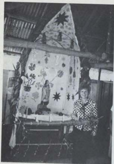
Children of Yacapana decorate the altar with banana blossoms.