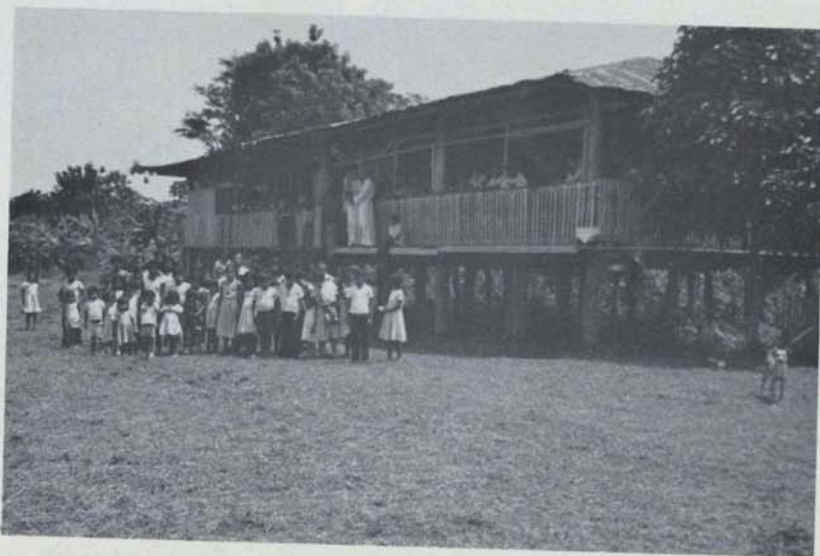
After the ceremony of the blessing of Kateri's statue, the faithful gather together in front of the school which serves as church.