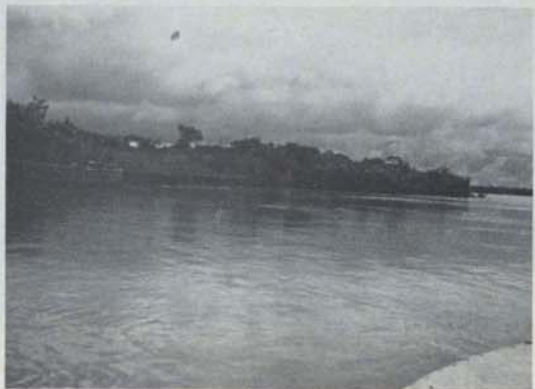
Then they land at Yacapana at 10 a.m.