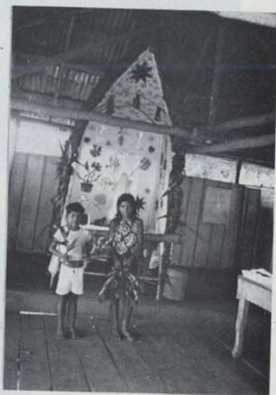
To honor Blessed Kateri, the altar was embellished with woven banana leaves and with banana and bamboo flowers.