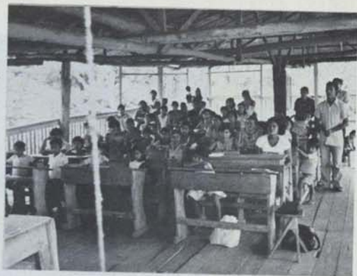
The interior of the school where Blessed Kateri was enthroned as protectress of Yacapana on January 16, 1982.