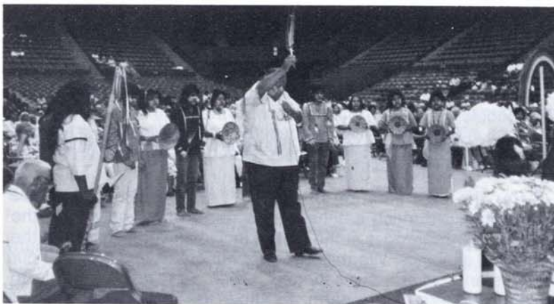
Danse tribute to time and life at the four corners of the Mother Earth, before a eucharistic celebration

Finally the natives showed their attachment to their customs and elders (many older Chiefs were present, with their wives). Their will to make liturgy their own was also evident. The use of incense in the celebrations was preeminent, the pipe of peace also, the singing in the vernacular, the colored offerings by so many tribes. All this in unity.