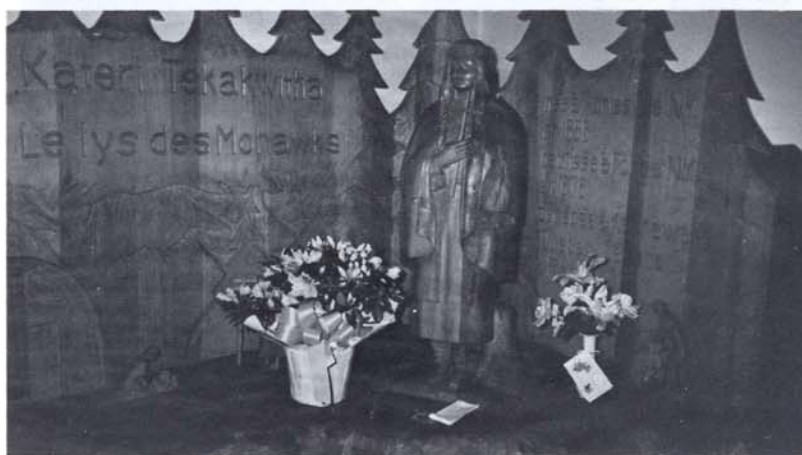
Church of Our Lady of Lorette, Village-des-Hurons, Quebec