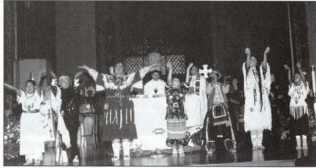
St Josephs' Church - Mass. Singing of our father.

particularly impressive was the group of Mohawks from Syracuse, Akwesasne and Kahnawake, Quebec.