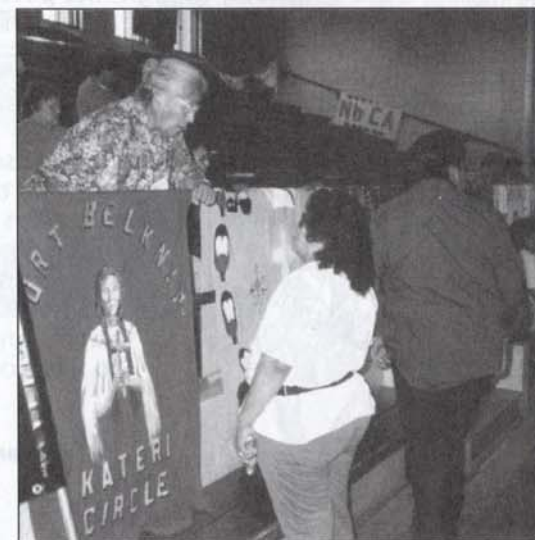
Some banners of the entry parade.