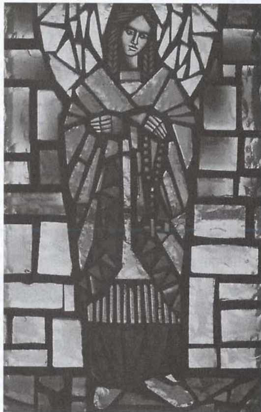
Kateri Tekakwitha Window in St. Bernard's Church, Youngstown, New York made of "chunk glass" which is rather thick but also limits the details in the window except for those painted on for the hands and face. Made by Standon Studios, Little Valley, N.Y. 14755

Her Feast will be celebrated at her Shrine in Kahnawke, on Sunday April 20th, at 11 a.m. You are all invited