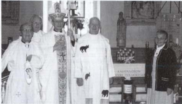
In front of the tomb of Blessed KATERI.