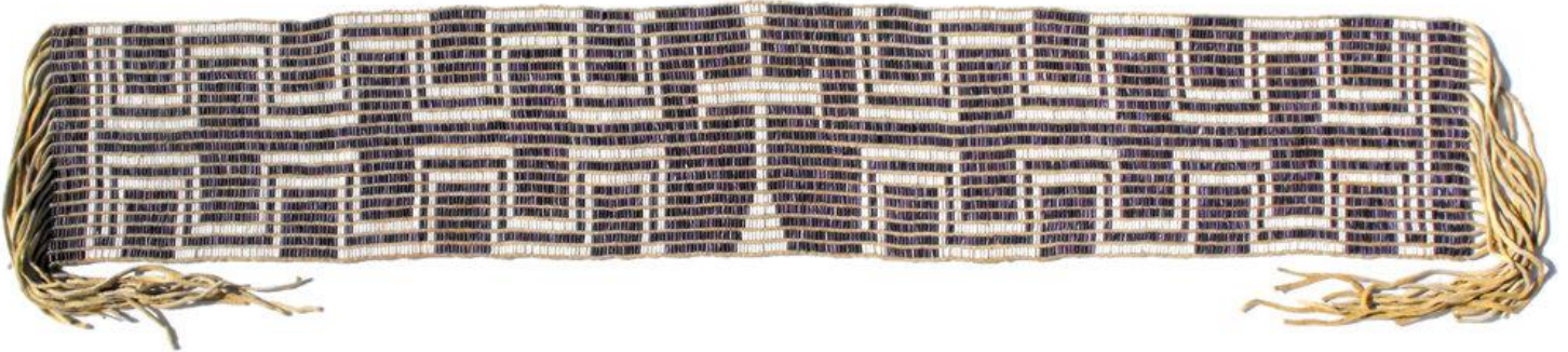
Replica of the Huron wampum belt given to Kahnawà:ke Mohawks in 1677. Reproduction and photograph by the author.

Below is a reproduction I made of the wampum belt in 2003. The pictures beneath it are actual photos of the belt, taken from a postcard available at the Catholic church in Kahnawà:ke, the 1922 book "Historic Caughnawaga," a newspaper article, and a website, respectively.