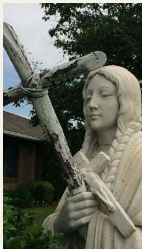
Statue of St. Kateri in front of church

The Kateri Circle is one in 68 parishes in the United States who gather to learn more about and emulate the life of St. Kateri Tekakwitha. We exist under the auspices of the Tekakwitha Conference in Alexandria, LA and we are the only one in Pennsylvania!